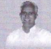
Shri Parsadi Lal Meena Minister of Medical Health & State Health Rajasthan