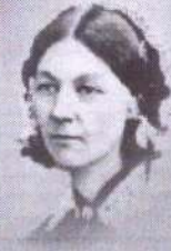
Florence Nightingale Founder of Modern Nursing