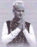
Shri Ashok Gehlot Chief Minister Rajasthan